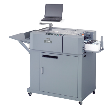
DC-616 PRO standard with PC Controller software